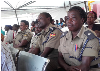
Women in armed forces: Uganda police officers at the hospital health assembly.