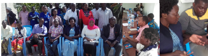
Clockwise from top left: MBFHI seminar participants pose for a group photo. A cross section of participants during the seminar.