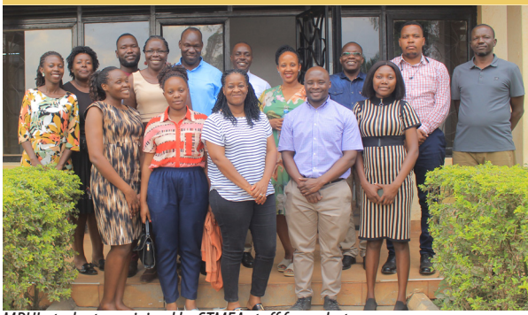
MPHL students are joined by STMEA staff for a photo.