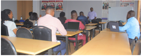
Onsite lectures at Mirembe Hall - UCU

The students who are from East Africa and southern Africa include social workers, communication professionals, health workers, entrepreneurs among others.