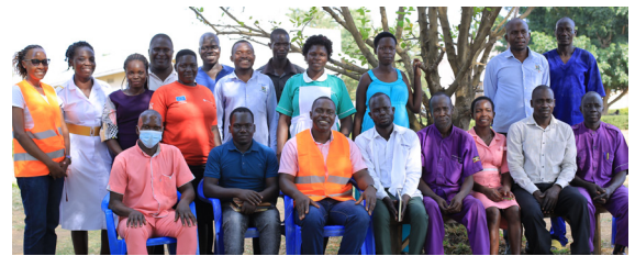
A group photo celebrating the STM-Amai Community Hospital partnership.