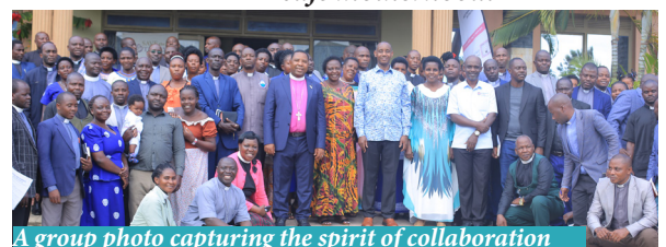
A group photo capturing the spirit of collaboration