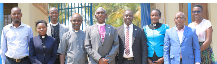
UCU-STM team joins the Bishop and his team for a group photo.

Together, we can save mothers and babies!